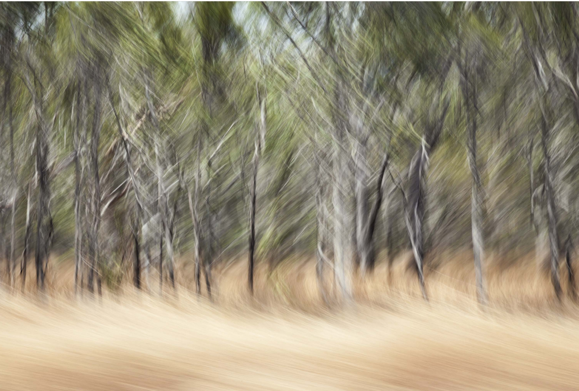
Queensland, Australia, 2012