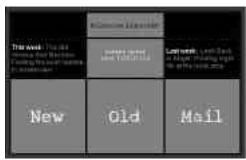
Figure 10.2 With a little imagination, you can use tables to replicate nearly any layout you can make with page layout programs such as Quark or PageMaker.

Table functionality was added to HTML to simplify presenting tabular data, such as scientific reports. While tables are still great for making, well, tables ( Figure 10.1 ), clever designers quickly realized that tables could be used to vastly improve design options ( Figure 10.2 ).