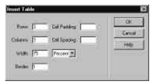
Figure 10.5 Click on the Table button on the Objects palette to open the Insert Table dialog box.