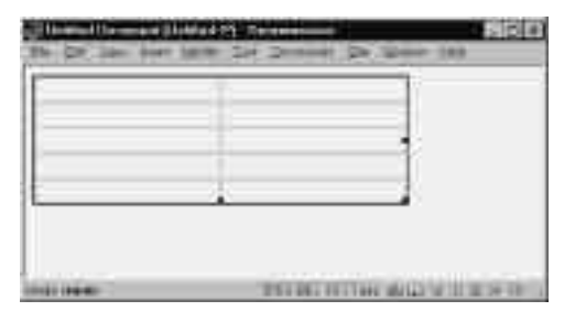
Figure 10.7 I inserted a new table with five rows and two columns.