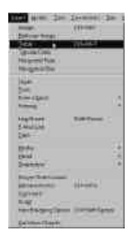
Figure 10.4 Choose Table from the Insert menu.