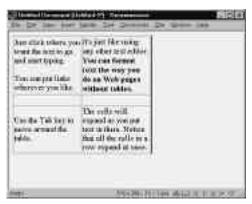
Figure 10.8 You can type and format text in a table just as you would text on a blank page.

Either way, your table will be selected ( Figure 10.9 ) and you can copy, cut, drag, or delete it.