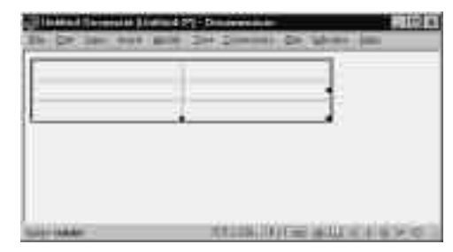
Figure 10.9 The entire table will be selected. A dark outline will appear around the table, and handles will appear in the lower-right corner of the table.