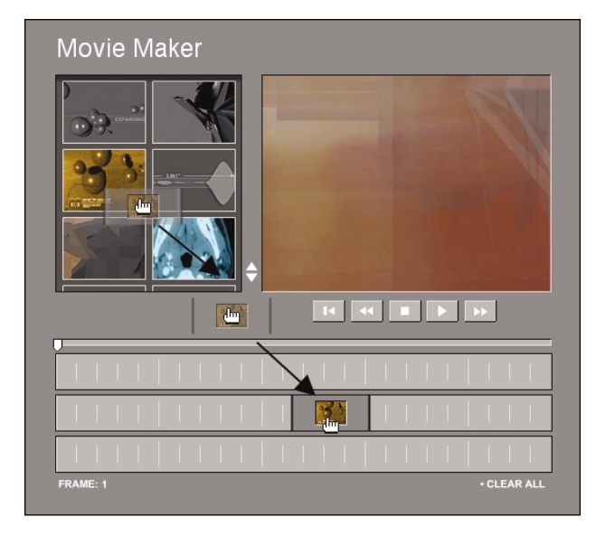
Adding a new timeline clip to the movie.