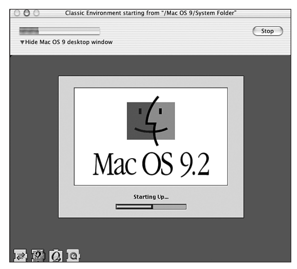
FIGURE 3.6 The hidden Mac OS 9 startup window.

When a Classic application launches, Mac OS X automatically launches Classic to provide an environment for the application to run in. If you click the collapsible triangle, you can actually see Mac OS 9 booting within Mac OS X (see Figure 3.6).