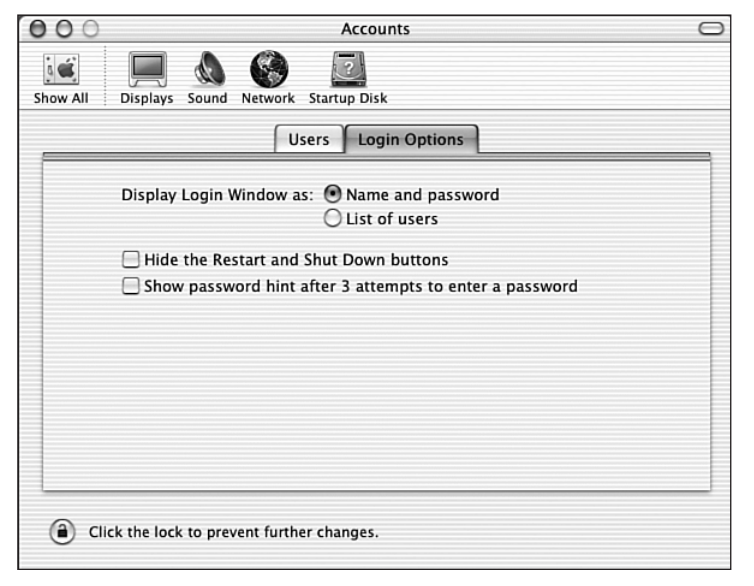
FIGURE 3.3 Login options.

Finally, uncheck the check box for Show Password Hint After 3 Attempts to Enter a Password. Selecting this causes the hint that was entered when the user was created to be displayed on the login screen. This can be handy if you have forgotten your password, but it can also be handy for an attacker. Make a point of remembering your password and you will need this option. Besides, after you get used to logging into your machine, entering your password will become second nature to you.