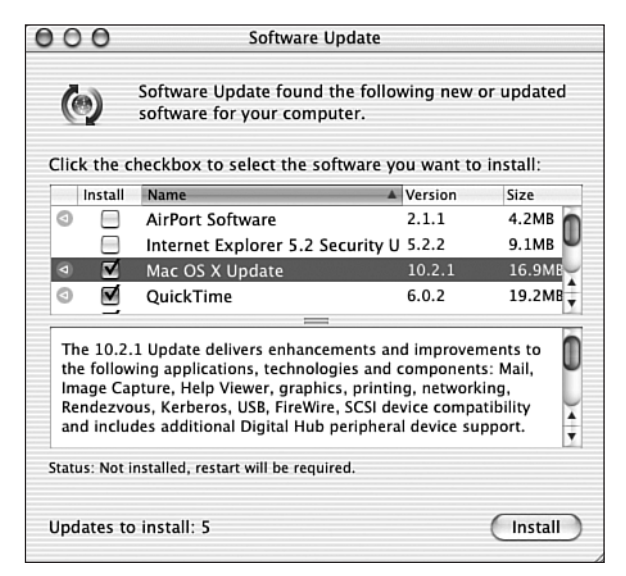
FIGURE 3.7 The Software Update panel.

The Software Update Preferences pane controls Mac OS X's automatic update features. The Update Software tab controls the frequency of when Software Update runs. Set this to daily to be as current as reasonably possible. If you feel you need to check for updates by hand, there is a Check Now button that will run Software Update manually. When Software Update runs, it queries a server at Apple for any patches and fixes available for software installed on your computer (see Figure 3.7). If it finds anything that requires updates, it will display them to you and verify that you want the updates installed. After Software Update has run, run it manually another time. Due to dependencies on other updates, some updates may not be installed the first time. By running Software Update a second time, any packages with previous dependencies should be installed.